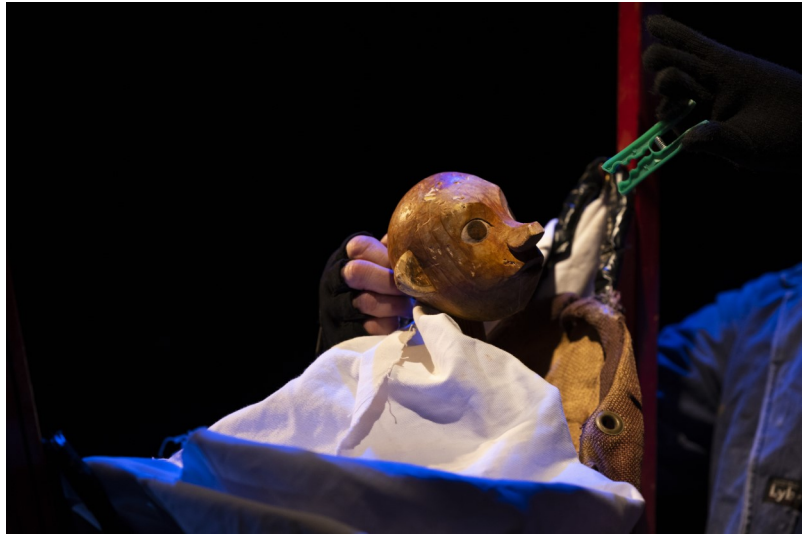
The cricket (green peg)