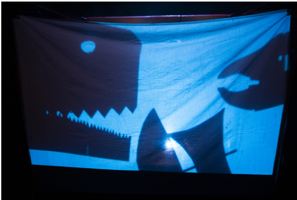
The Whale is a shadow puppet made of saws.