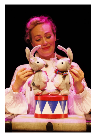
Flip and Flop the Rabbits