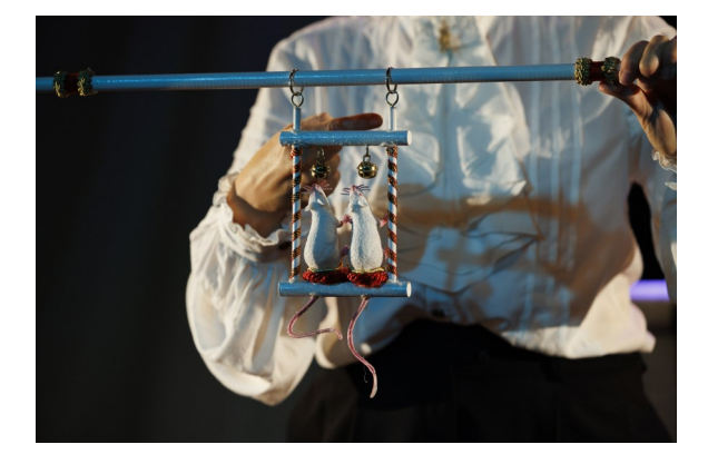
Monty and Mervyn the Mice