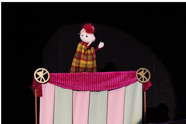
The Narrator Mouse