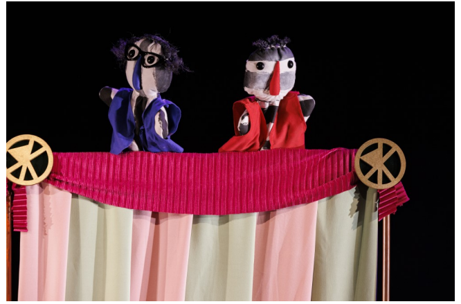
Tina and Gerald, the swindlers, are played by the performers and puppets