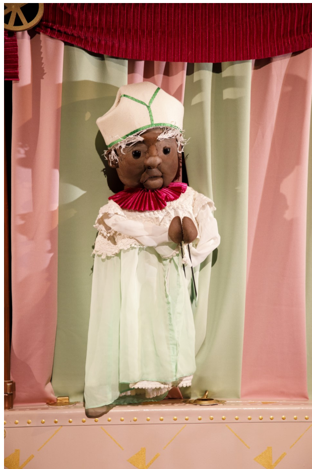
James, The Keeper of The Royal Undergarments