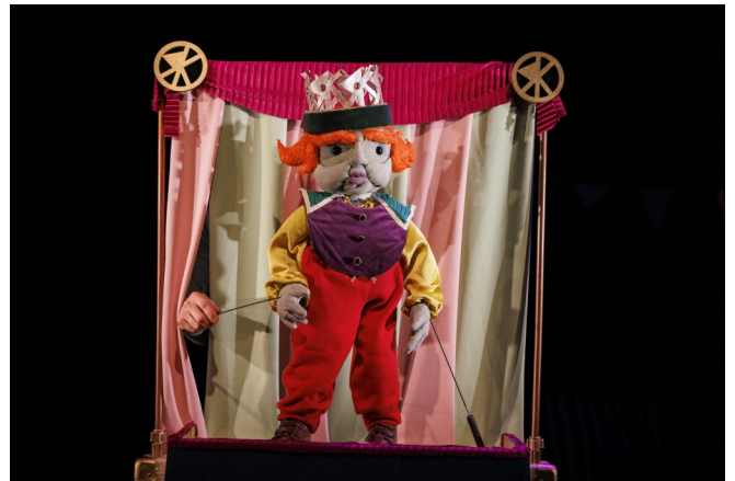
King Reginald is played by a performer and a puppet