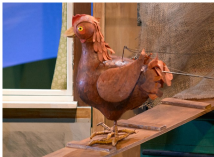
The Chicken (Poppet)