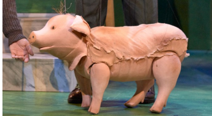
The Pig (Bella)