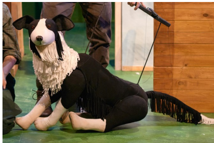
The Dog (Molly)