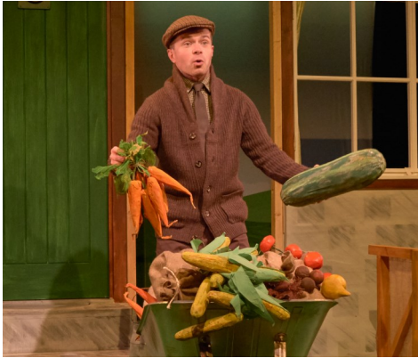
The Old Farmer

There are two performers in the show who play the human characters. They both also puppeteer a number of different animal characters, and also the Pixie. Sometimes they sing and perform as characters without puppets. All of the animal characters in the show are puppets.