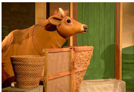
The Cow (Dolly)