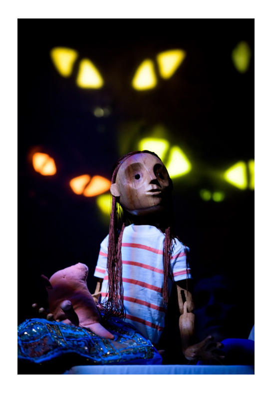
Lucy and Pig Puppet

All of the characters in the show are puppets.