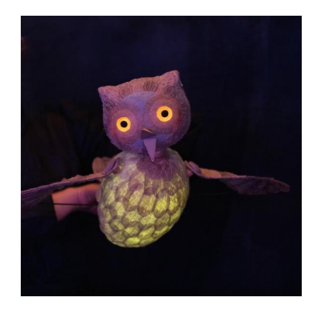
The Little Owl

As this is a puppetry show the characters are mostly puppets. The performer plays the part of the Night Watcher.