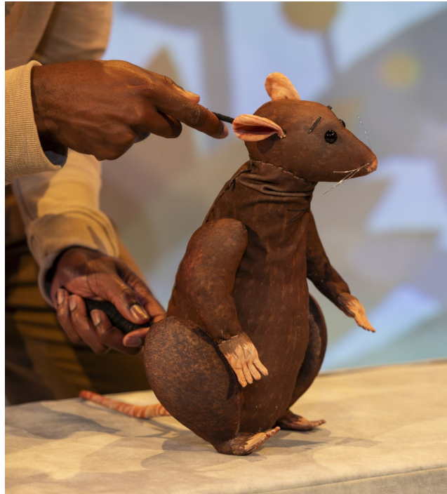
A lonely rat, Lucien