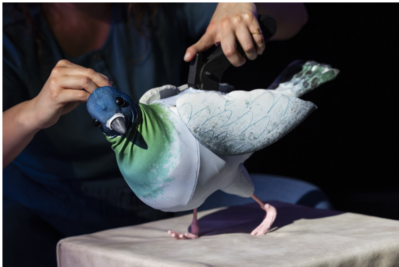
An amazing pigeon, Giniqua