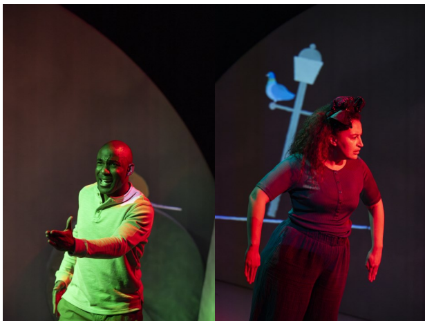
Green and Red Road Crossing People