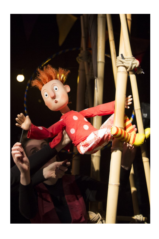
Fabrize the Human Volcano