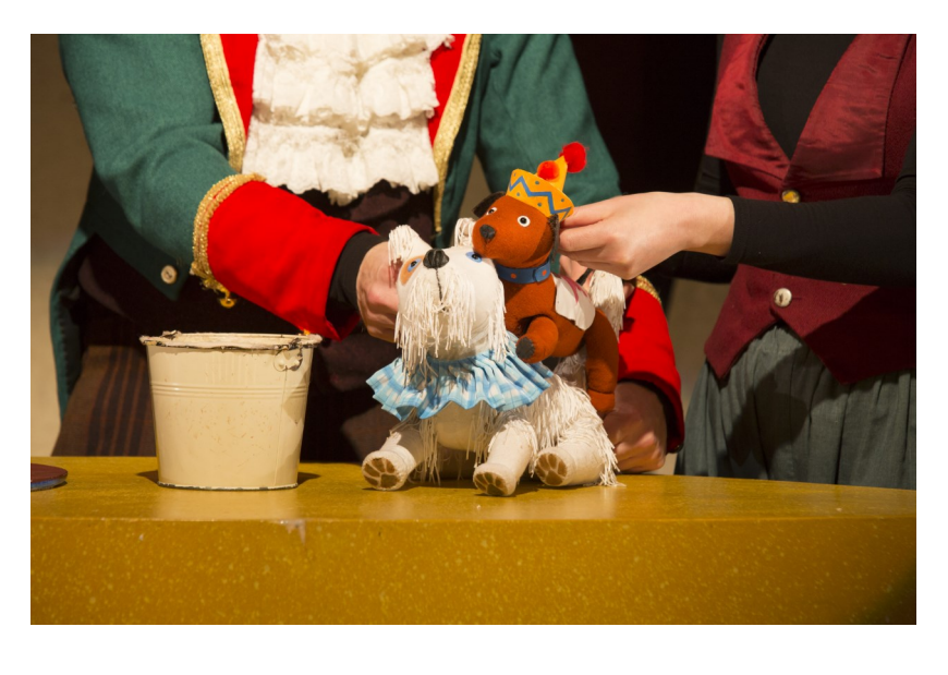
Ding and Dong the Performing Hounds