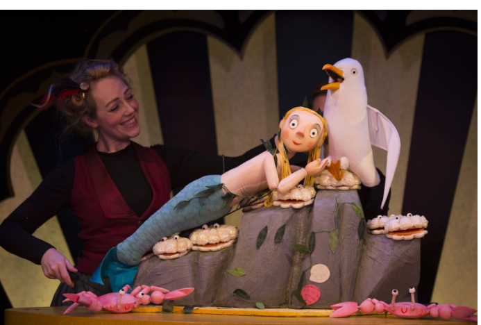
The crabs and the clams