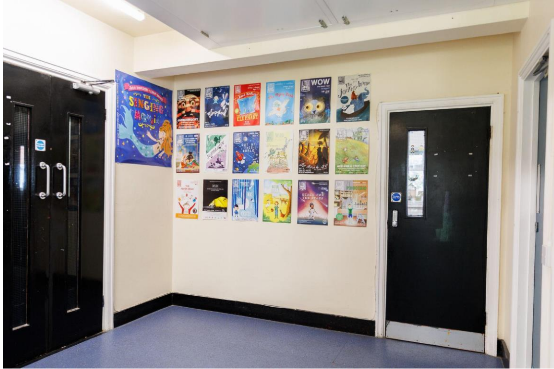
Studios Office exterior