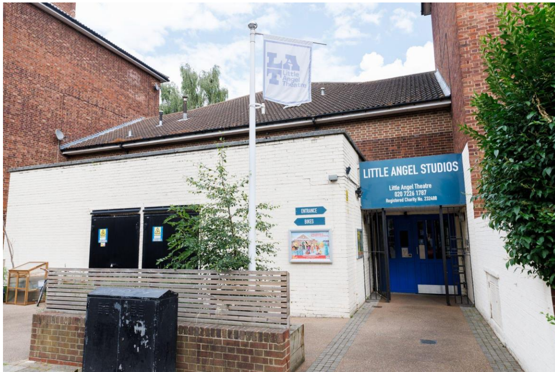
Front of Little Angel Studios