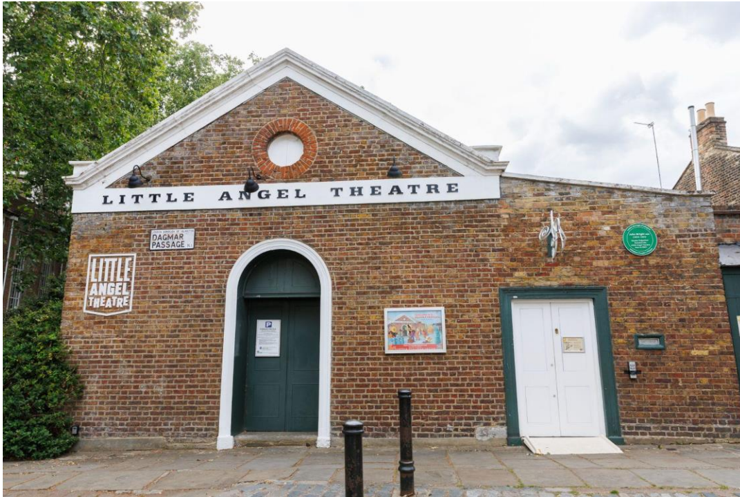
Front of the Theatre