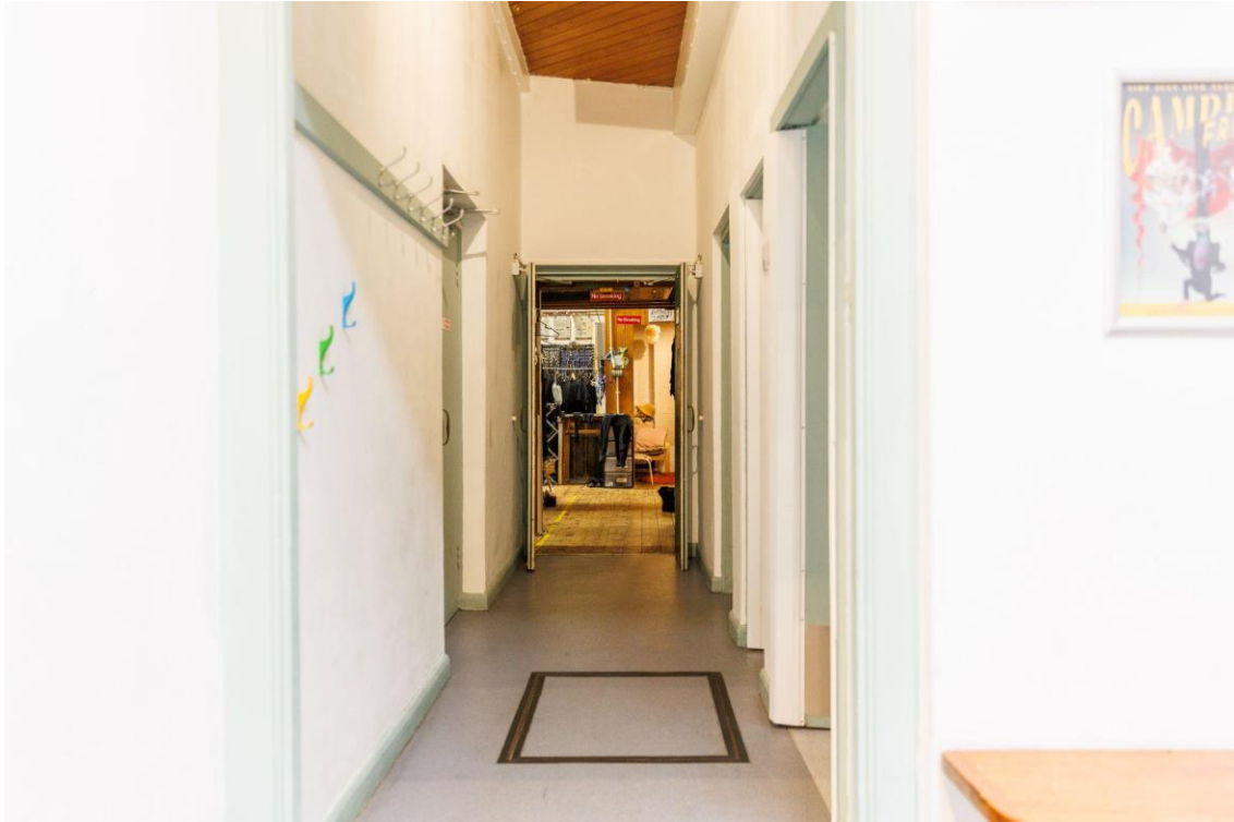
Theatre Corridor to Office (toilets on right hand side)