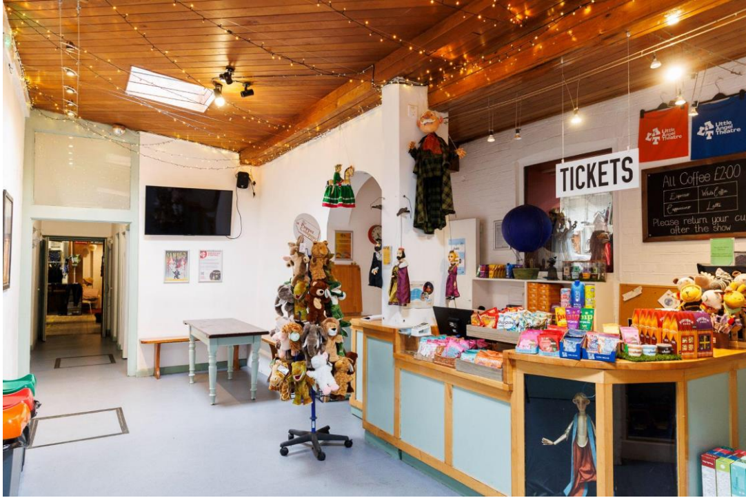
Theatre Box Office