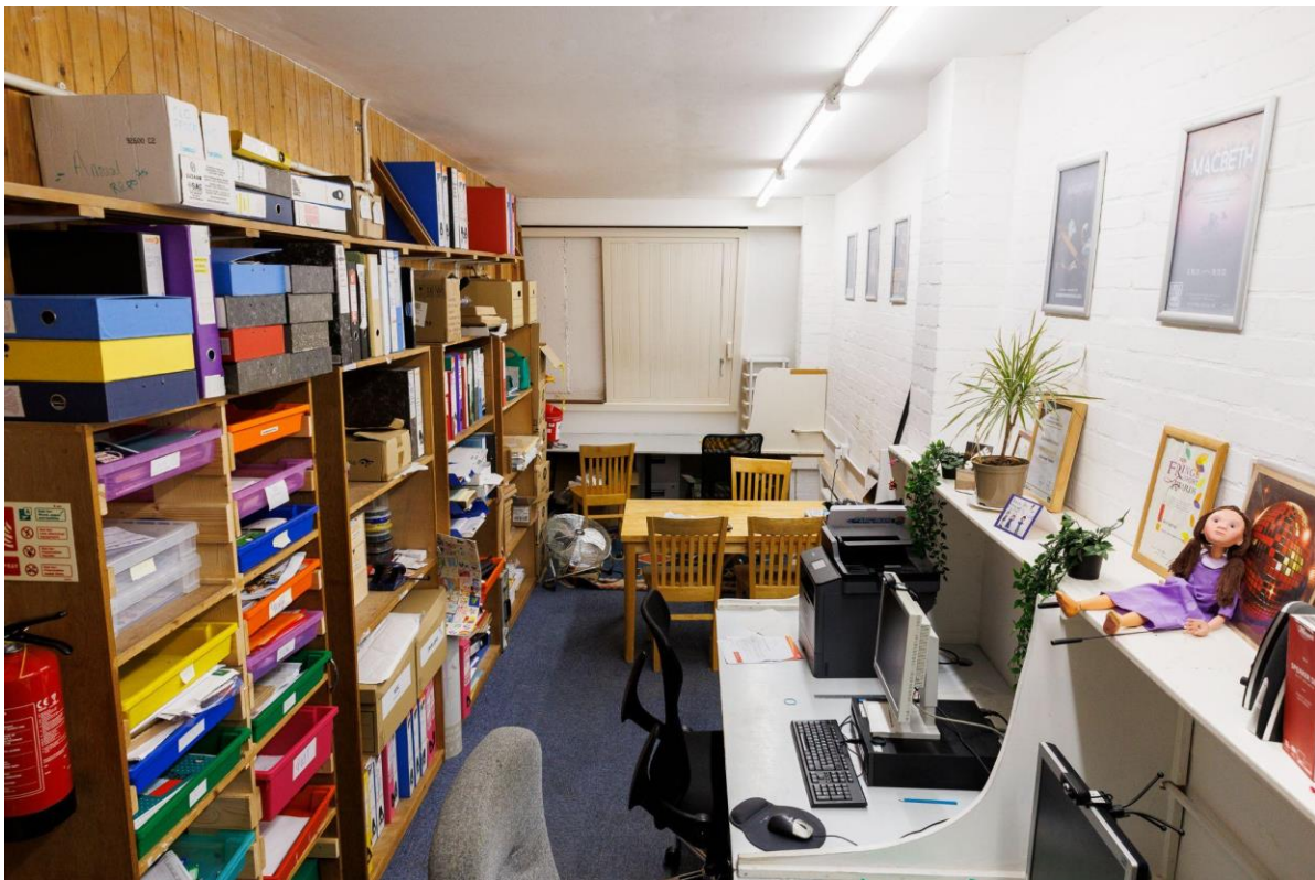
Theatre Office (no step-free access)