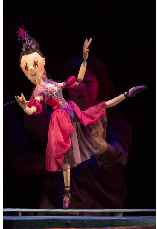
The Prima Ballerina