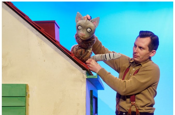
The farm hand, who is also the main puppeteer for the animals