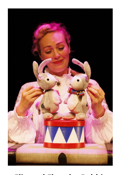
Flip and Flop the Rabbits