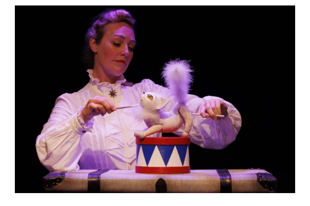
Miss Scratchy Cat

Note: There are also performing fleas but they are so small it is very hard to get a photograph of them!