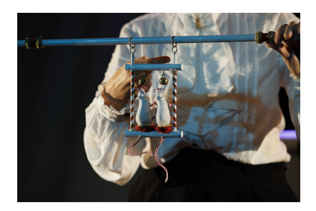
Monty and Mervyn the Mice