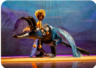
Lottie the Travelling Doll A String Theatre production