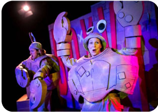
Boxville A Cardboard Adventures production