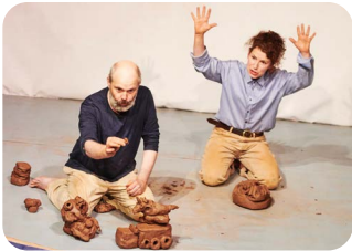
Claytime An Indefinites Articles production