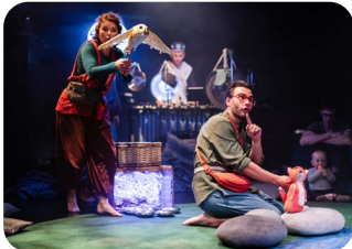
Under the Little Red Moon An English Touring Opera production