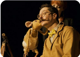
Moonsmile A Goofus Theatre production