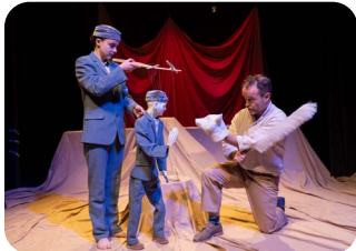
The Little Prince A Lyngo Theatre production