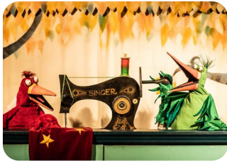
Out of the Hat! A Long Nose Puppets production