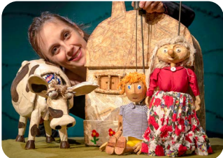
Jack and the Beanstalk A Garlic Theatre production