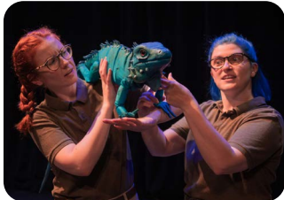
The Zoo that Came to You A Scarlet Oak Theatre production